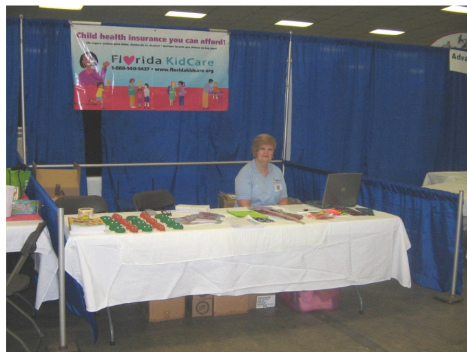
Families County Application Assistance Outreach