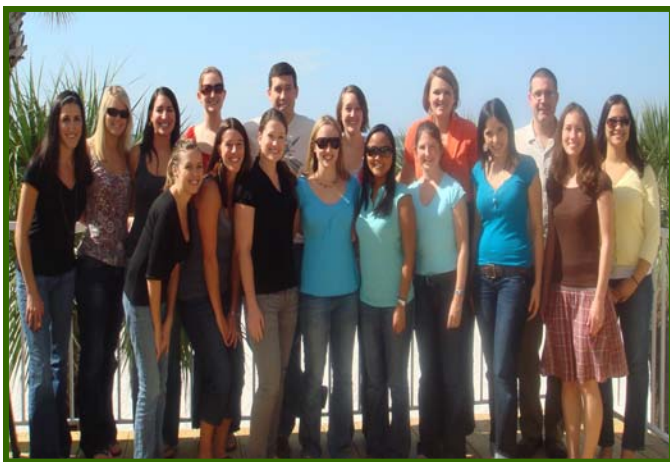
The Intern Retreat was held at Hilton Clearwater Beach and it was successful.