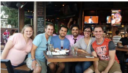
Impromptu gathering of intern classes—current interns welcoming the new interns.