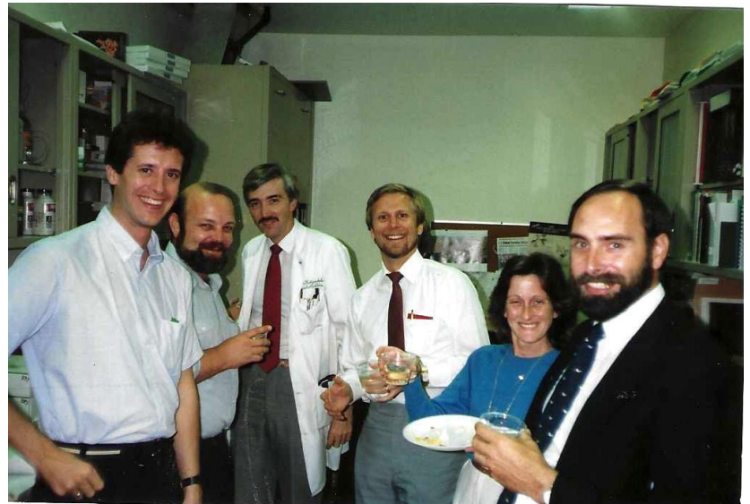
Fun times at the VA!