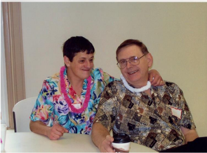
Fun times at a family reunion!