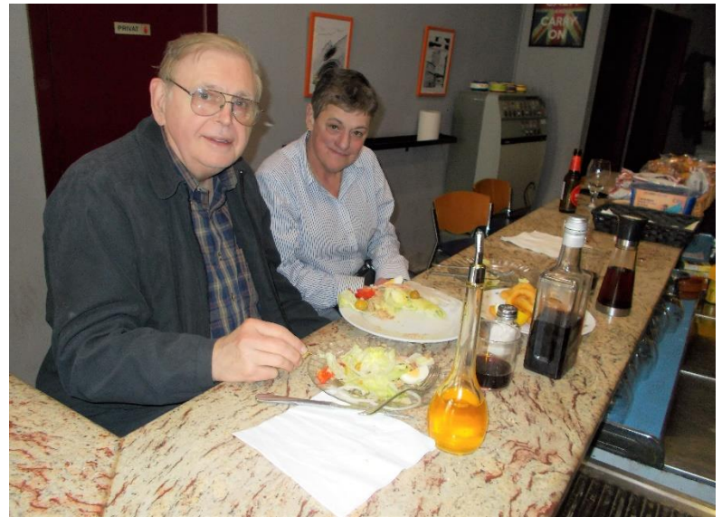
At a restaurant, Verdu, Spain