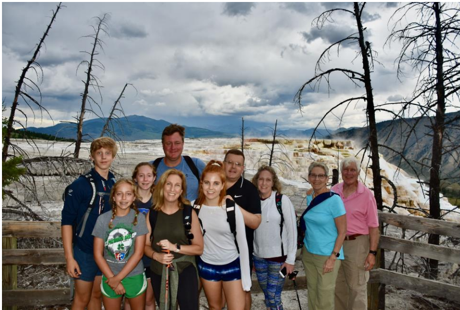
The Ballow family at Yellowstone National Park