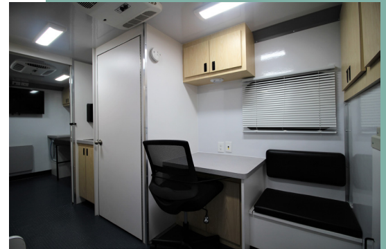
Pictured (above): inside the USF College of Nursing Mobile Health Unit