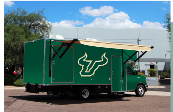
Pictured (above): the purchased Mobile Health Unit before an official wrap has been designed and installed

Through a four-year grant from the Health Resources and Services Administration (award number UK1HP46068), the USF College of Nursing is launching the Mobile Health Unit (MHU). Complete with two exam rooms, a bathroom, a freezer, and a pop-up awning, the MHU will be staffed with two advanced practice registered nurses (APRNs), a patient care coordinator, faculty preceptor, and will serve as a clinical training site for undergraduate nursing students. Starting in year two, rotation opportunities will be available to interprofessional teams of students in USF Health. The project will be guided by a Community Advisory Board that will meet twice a year.