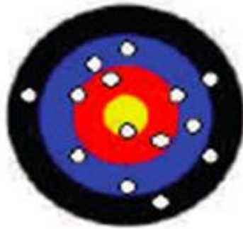
Figure 1: Targeting Process Variation