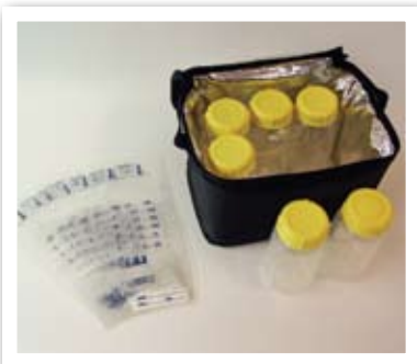
Milk Storage Bags and Bottles