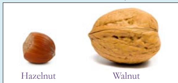
The Newborn Tummy

At birth, the baby's stomach can comfortably digest what would fit in a hazelnut (about 1-2 teaspoons). In the first week, the baby's stomach grows to hold about 2 ounces or what would fit in a walnut.