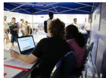
2013 Polk County Back-To-School Enrollment/Media Event