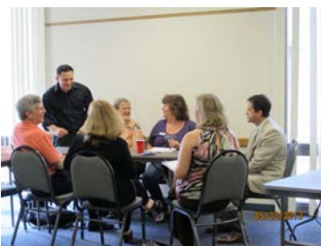
Florida KidCare Local Coalition Annual Meeting May 2013

This report highlights three such examples of implementation of a multi-prong Florida KidCare outreach at the local level and highlight how these efforts vary from one community to the next. Broward County Health Department, Florida Community Health Centers and Golisano Children's Hospital of Southwest Florida are FL-CKF partners that have embraced the priorities to implement their own multi-prong approaches to Florida KidCare outreach. The Florida KidCare enrollments within each of these geographic regions have shown significant increases, corroborating this as an innovative method to reach families with uninsured children.