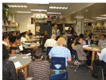
Refugee, English Language Learner Train the Trainer