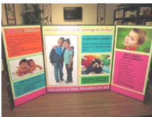
Pinellas County Healthy Start Coalition, Inc.'s Florida KidCare Display

Healthy Start Every baby deserves a healthy start