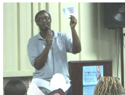
Gadsden County Healthy Start Florida KidCare Back-to-School Enrollment Event