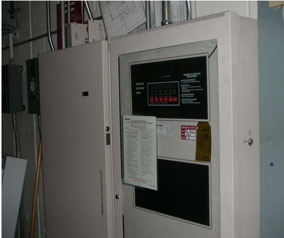
Picture of Main HSC Fire Alarm Panel