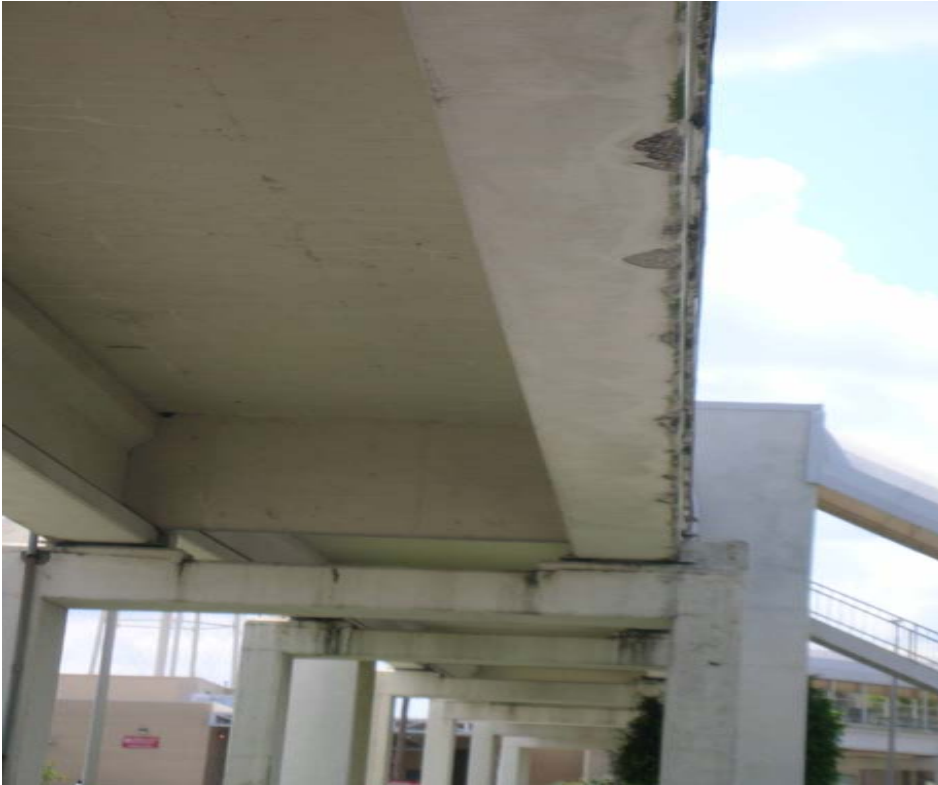
View of Skyway Underside