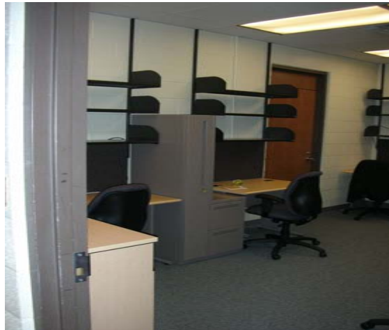
Renovated MDC 3012/3015 Lab