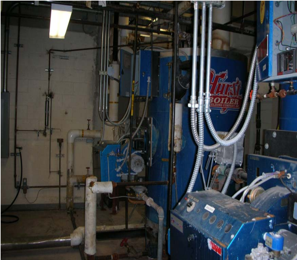
Picture of existing boilers