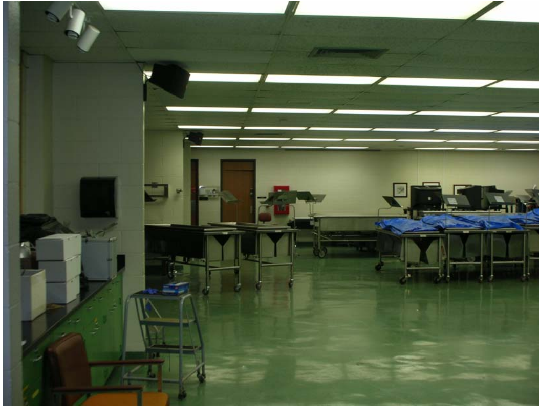
Picture of Current Anatomy Lab