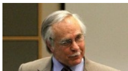
Critics question whether sickle cell trait can cause sudden death