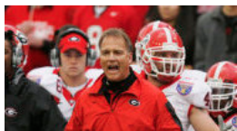
Georgia coach Mark Richt talks about his personal connection to sickle cell trait