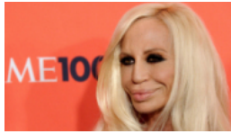
Celebrities addicted to plastic surgery