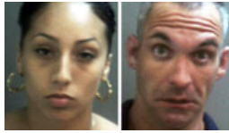
Orange County Jail booking mugs -- updated daily