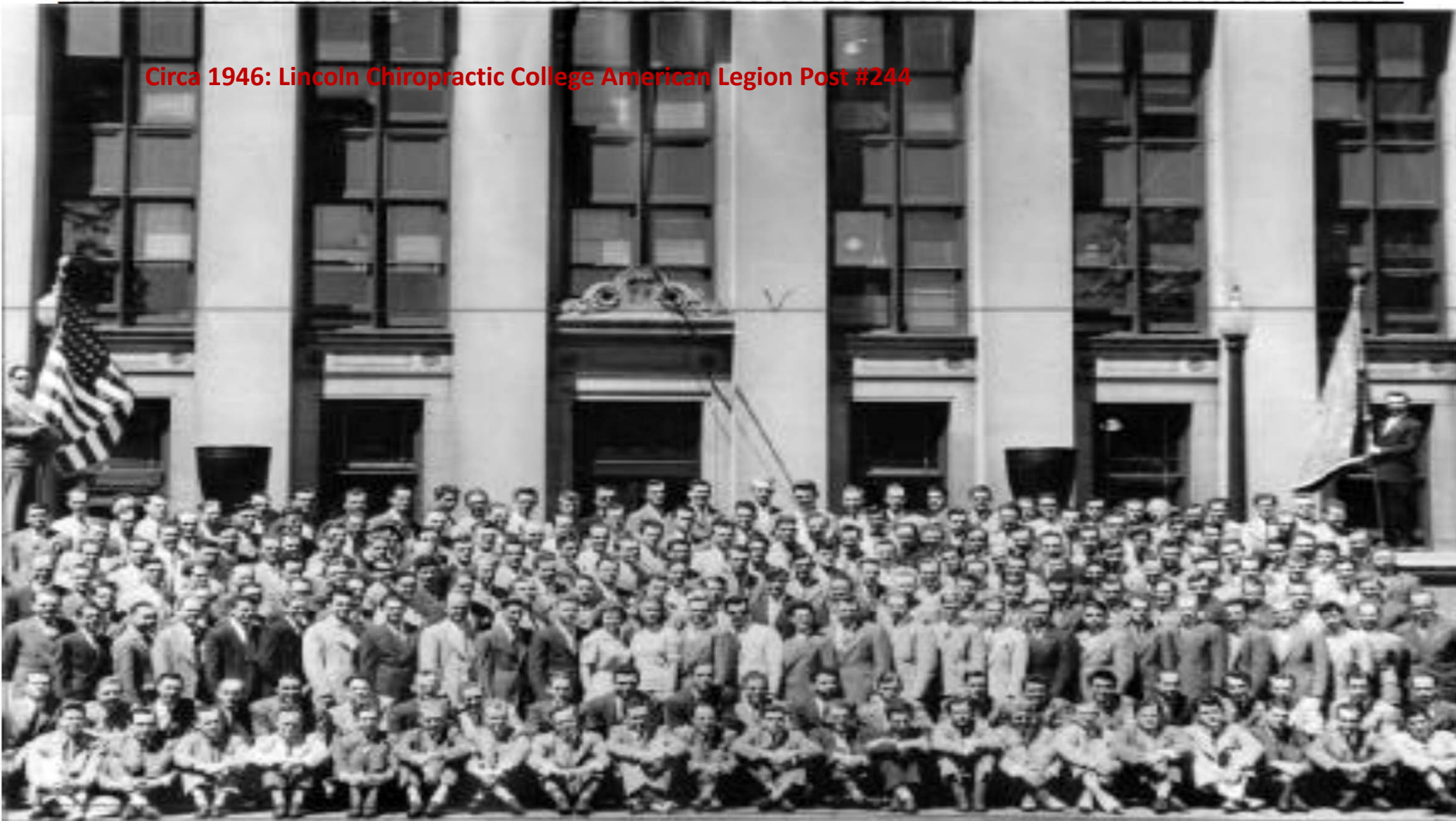
Circa 1946: Lincoln Chiropractic College American Legion Post #244