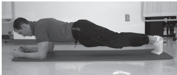
FIGURE 2: Depiction of the Plank test used to assess core muscular endurance.

After a four-minute rest, isometric core muscular endurance was assessed with the Plank test (Figure 2) [1]. For the Plank test, the participant was positioned as follows: prone position on a floor mat; upper body elevated and supported by the elbows; hips and legs elevated off the floor so that the neck, trunk, and lower extremities aligned in the sagittal plane (straight body alignment maintained from shoulder through hip, knee, and ankle); body supported on forearms and toes; elbows directly under the shoulders; ankles maintained at 90°; scapulae stabilized with elbows at 90°; spine in a neutral position throughout the assessment. As soon as the participant lifted the torso off the mat, a test examiner began timing with a stopwatch. The participant was verbally encouraged by the test examiner to hold the test position as long as possible. The participant was not informed of elapsed time while the test was being performed. If the participant was unable to maintain the test position, the participant would be given a maximum of two warnings from the examiner to reestablish the position. If the participant was unable to do so, the examiner stopped the test, and time was recorded in seconds. The Plank test has been shown to be a reliable measure of isometric core muscular endurance [14].