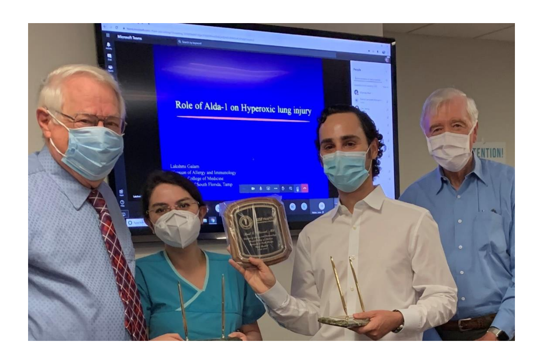
L to R: Hey hey hey, we made it!!!!