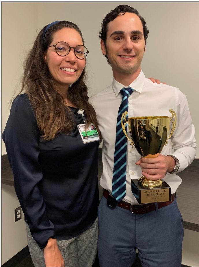
American College of Allergy Asthma and Immunology (ACAAI) 2019 Annual Meeting, Fellows-in-Training Bowl, Houston, TX, 2019