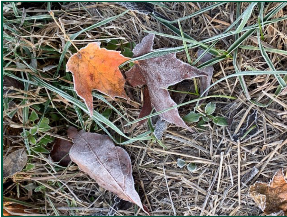
“Fall picture”