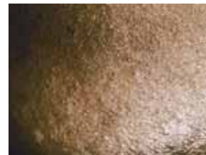
Hair On Black Skin — 7 Months after 4 IPL Treatments