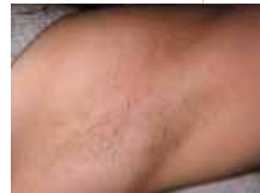
Hair On The Underarm — 4 Months after 2 IPL Treatments