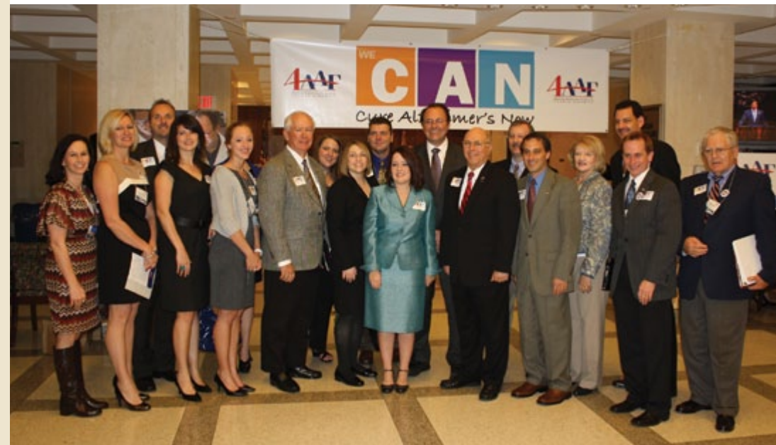
Members of the American Advertising Federation-Fourth District, state legislators and representatives of the Byrd Institute gather at the State Capitol to kick off the We CAN Alzheimer’s awareness campaign.

Advertising professionals around Florida are asking citizens to “turn up the volume” on Alzheimer’s awareness and public funding in a unique public service campaign. Presented by the American Advertising Federation – Fourth District with USF Health, the We CAN Florida campaign will reach millions, presenting the bold assertion that Alzheimer’s disease is preventable. The “CAN” in “We CAN” means Cure Alzheimer’s Now.