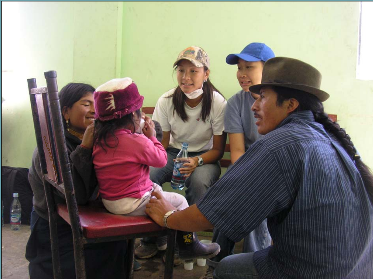
USF Health College of Public Health Students in Ecuador

For international students studying at USF Health, the Office of International Programs facilitates transitions by negotiating obstacles and connecting new students with mentors. In addition, the Office advises on strategies to bring potential global partners together to develop and implement agreements for international education and research projects. Workshops and seminars promote skills needed for success in the global arena, including cultural competency, safety, leadership, and ethics.