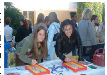
High school students visit the COM table during Access Day.

information on volunteer opportunities and careers. There were presentations that included information on applying to college, financial aid and an overview of USF undergraduate studies. To add to the atmosphere of learning, fun was also provided. There were beach balls, candy, balloons and board games. Once again AHEC has done a wonderful job bringing information to many students.