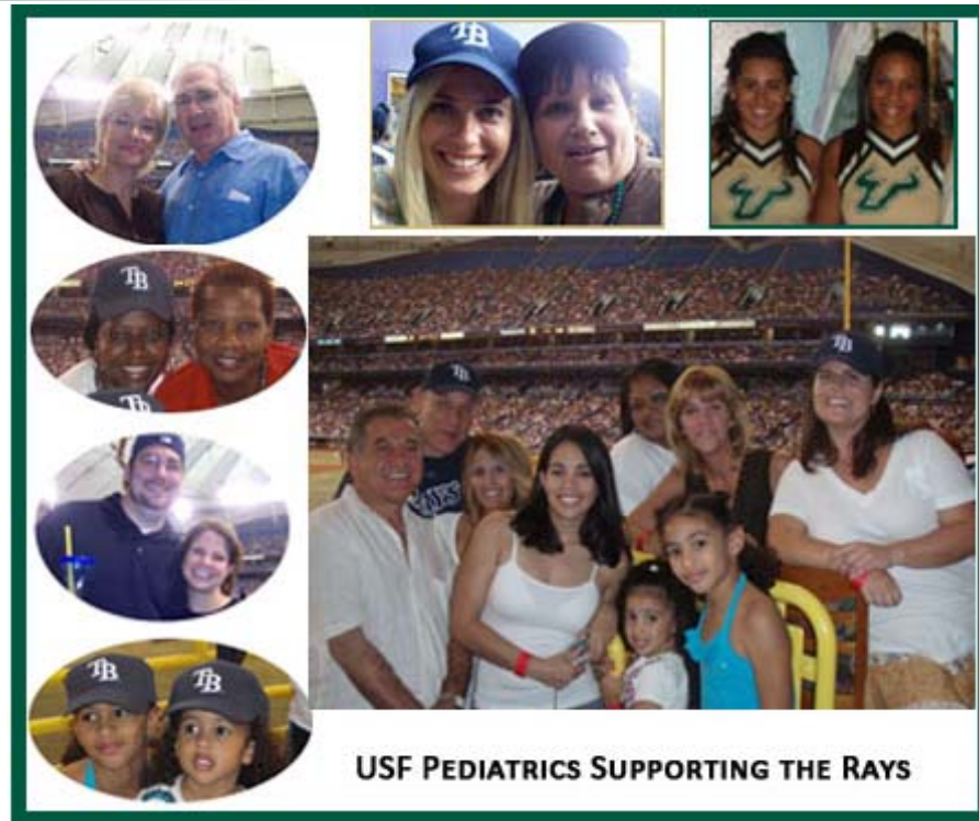
USF PEDIATRICS SUPPORTING THE RAYS

The Staff Appreciation Event was on 8/14/10 at Tropicana Field. Tampa Bay Rays won 7-3 against Baltimore Orioles. It was a great game and we all had a great time!