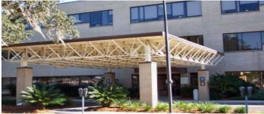
Building Front Facing Magnolia Drive

3515 East Fletcher Ave, Suite E, Tampa, FL 33613