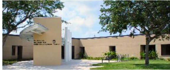
SCDC Suite E Entrance @ back of Building

After entering the parking lot, follow the drive on the right side of building. Go past the white gazebo. Silver Child Development Center is Suite “E” at the back/East side of building