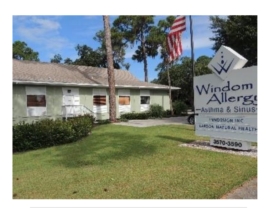
If you're ever in Sarasota, drop by and say hello!