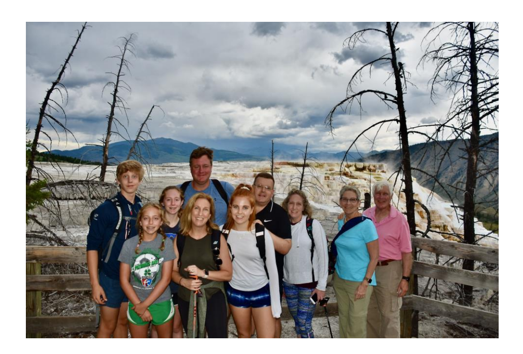
The Ballow family at Yellowstone National Park