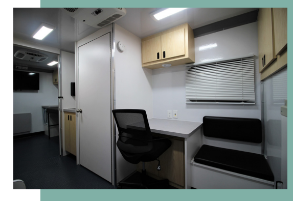
Pictured (above): inside the USF College of Nursing Mobile Health Unit