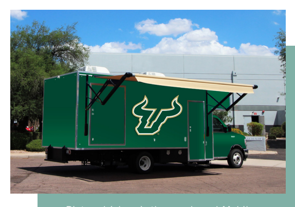
Pictured (above): the purchased Mobile Health Unit before an official wrap has been designed and installed

Yes, absolutely! Email MHUnursing@usf.edu for more information on interprofessional rotations, sponsoring a route, van locations, or any other questions.